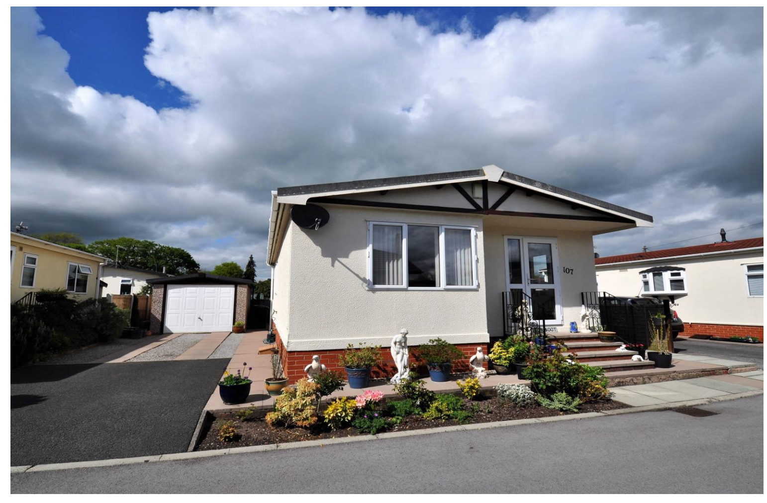
Spacious Park Home Two Good Size Bedrooms with Wardrobes Ample Off Road Parking and Garage